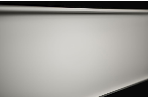
STANDING SEAM PANEL IN SURFMIST